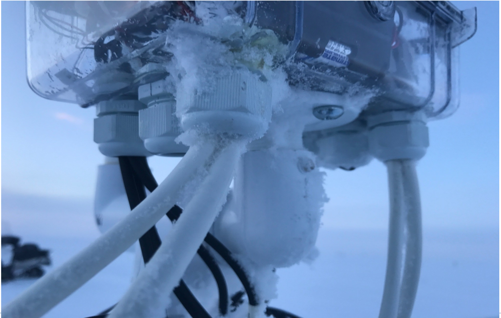
Linux Powered Autonomous Arctic Buoys - Embedded Linux Conference - Prague October 2017